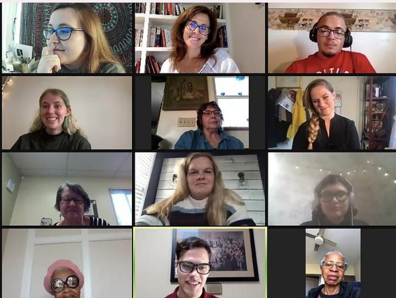
The ReGen Storytelling Workshop- Ypsilanti Senior Center